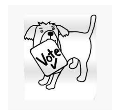
Voting starts next week!

Submissions for the Honorary Talbot are in! Now it's time to vote...but we need volunteers to help the students cast their votes. Click on the signup genius to see open time slots: https://www.signupgenius.com/go/4090e4faea928a3f94-voting